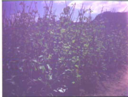
Plate 1. Demo farm in Ambasing, Sagada, Mountain Province

Methods. Farmer cooperators, cultivating beans, were identified from selected places in Mountain Province. Field trials and or demo farms were done to showcase the biological nitrogen fixation (BNF) technology to farmers. Farmer cooperators helped maintain the demo farms together with the researcher or extensionist. Field trials in beans were made in Ambasing, Sagada (Plate 1); Egan, Tadian (Plate 2); and Amgayang, Tadian (Plate 3). A standard microbial inoculant ( Rhizobium , CIAT) was obtained from BIOTECH, UPLB, Los Banos, Laguna.