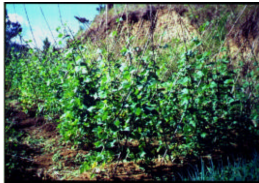
Plate 2. Demo farm in Egan, Tadian, Mountain Province